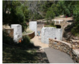
HEPBURN MINERAL SPRINGS RESERVE SOHE 2008