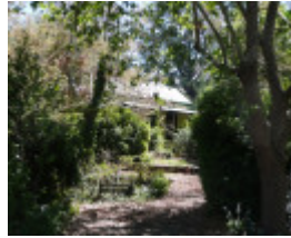
HEPBURN MINERAL SPRINGS RESERVE SOHE 2008