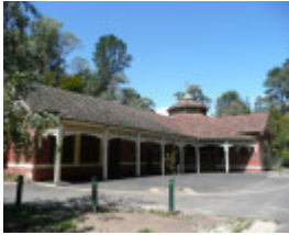
HEPBURN MINERAL SPRINGS RESERVE SOHE 2008